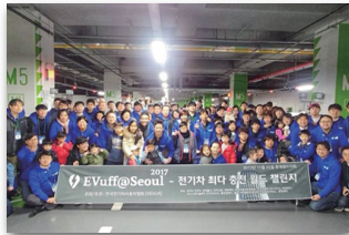
EVuff@Seoul 2017/11/25 Lotte World Tower