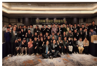
2023/12/12 EVolution, The Korea Electric Vehicle Users Association 'Electric Car Enthusiasts Night' Hosted