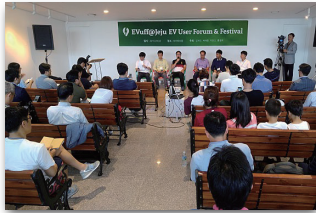
EVuff@Jeju 2016/09/03 Lightrium in Jeju