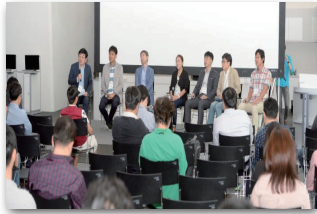
EVuff@Seoul 2016/09/23 DDP in Seoul