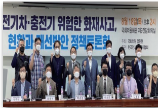
2022/08/18 Parliamentary Forum on Electric Vehicle and Charger Fire Improvement Measures