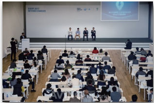
EVuff@BMW 2017/03/04 BMW Driving center in Incheon