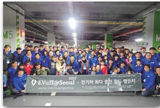
EVuff@Seoul 2017/11/25 Lotte World Tower