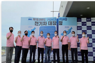
2021/09/06 the Korean PeninsulaPeace Road