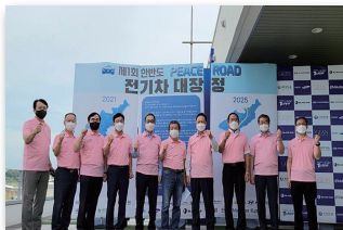
2021/09/06 the Korean PeninsulaPeace Road