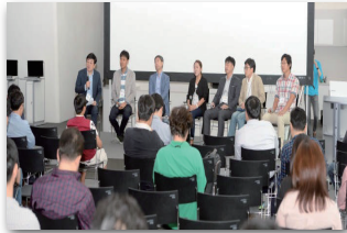
EVuff@Seoul 2016/09/23 DDP in Seoul