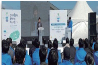
EVuff@Jeju 2018/03/17 Citizens' Welfare Town in Jeju