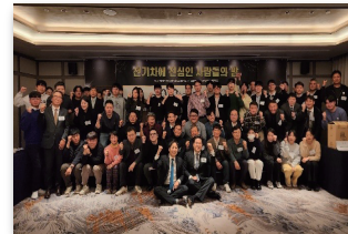
2023/12/12 EVolution, The Korea Electric Vehicle Users Association 'Electric Car Enthusiasts Night' Hosted