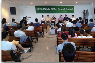
EVuff@Jeju 2016/09/03 Lightrium in Jeju