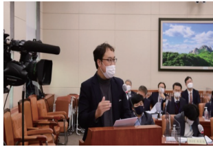
2021/10/20 Attendance at the National Assembly's parliamentary audit