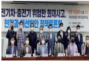
2022/08/18 Parliamentary Forum on Electric Vehicle and Charger Fire Improvement Measures