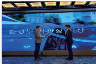
2023/12/14 Commendation from the Minister of Environment Affairs