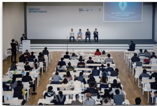
EVuff@BMW 2017/03/04 BMW Driving center in Incheon