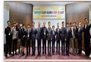
EVuff@EVTrend 2023/03/16 COEX