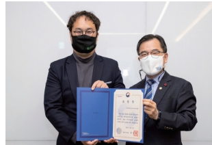
2021/12/10 Commendation from the Minister of Environment Affairs