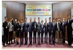
EVuff@EVTrend 2023/03/16 COEX